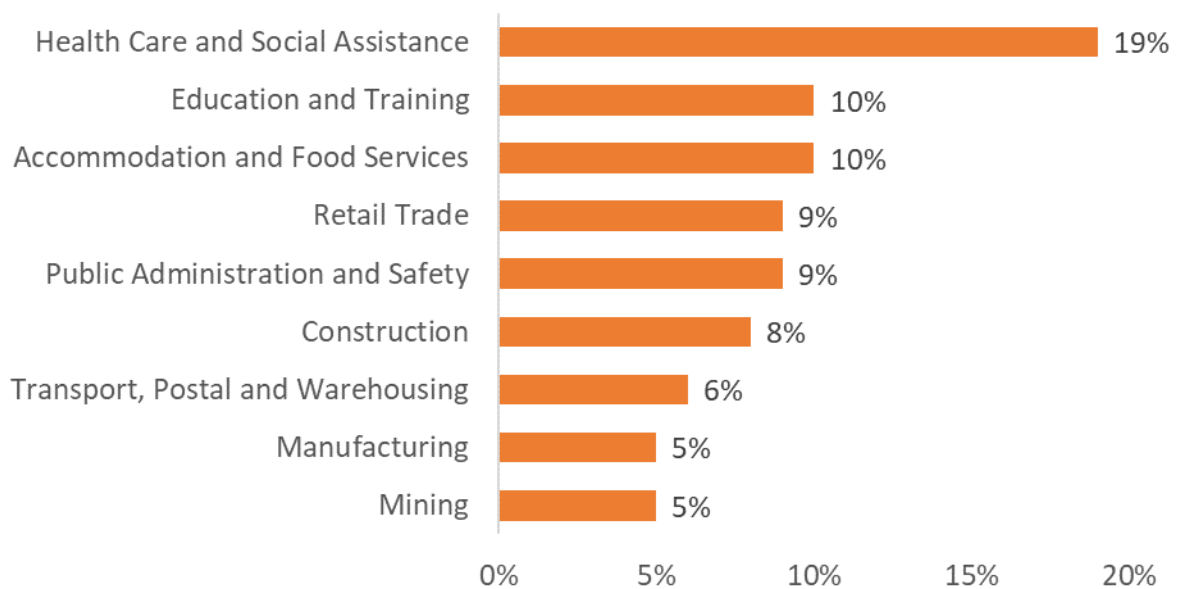
Graph 1 Indigenous employment by selected industries